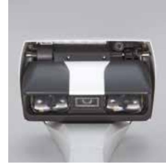
Large depth of field lens

Maximised auto focus area even when the focus distance is variable