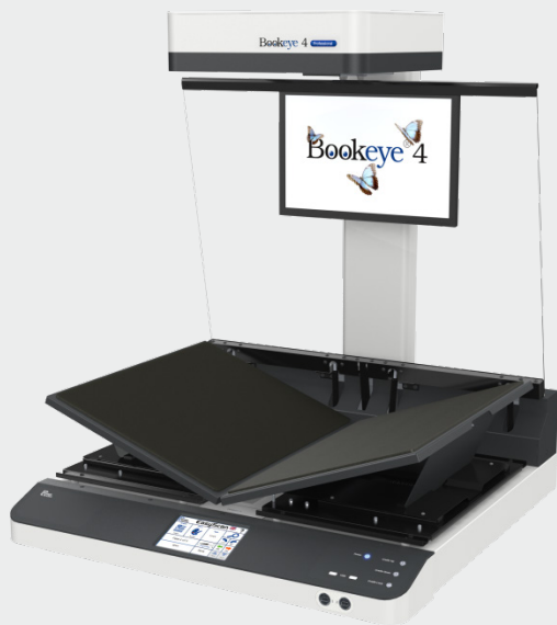
Scanning a book using the protective V cradle for fragile bound documents.

Bookeye® 4 V1A is suitable for digitization projects that require high quality and maximum productivity, even in 24/7 operation. Originals up to A1+, such as books, magazines, posters, folders or bound documents of all kinds, can be digitized by the Bookeye® 4 V1A at unsurpassed scanning speed.